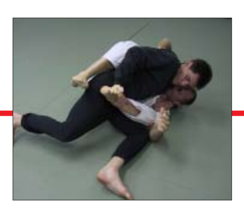
Continuing the twisting motion, Black uses the force of his hips and his right hand to break White's feet open.