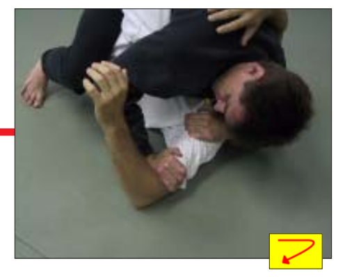
Keeping his weight on White's head, Black traps White's left upper arm to prevent White from punching.