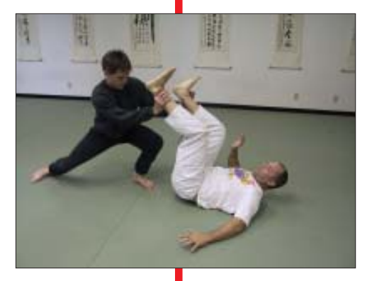
Black suddenly lunges in toward White, keeping his head back and pushing up below White's feet to guard against kicks.