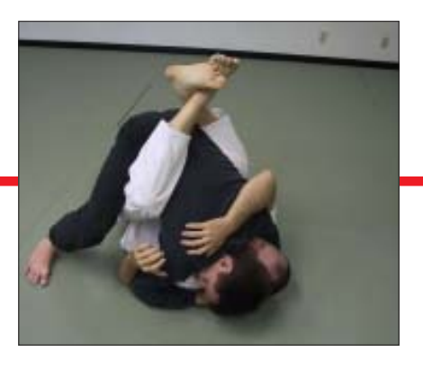
Black lifts his hips and drives forward to crush White's head with his left shoulder.