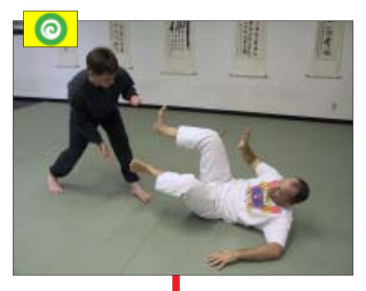
White is on his back keeping Black away with his feet.

The guard is held in one of two basic positions, closed (with the opponent locking his feet behind your back) or open. The fighter in the guard will pass in one of two basic positions, standing or on the knees. Finally, there are only three basic methods of passing the guard, over