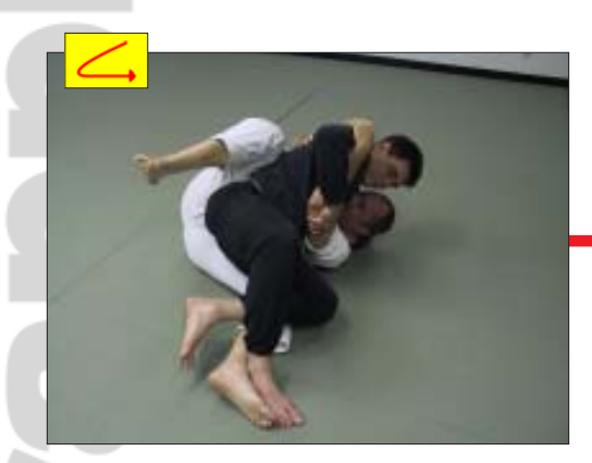
With his weight pressing White's left leg down, Black steps his right foot over White's left foot.