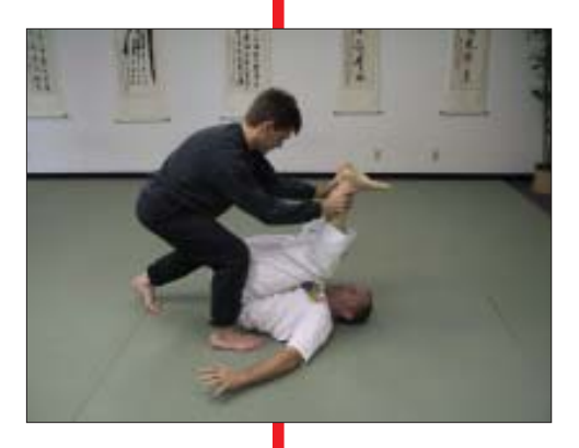
Black steps up with his back foot and pushes White's feet up over his head.