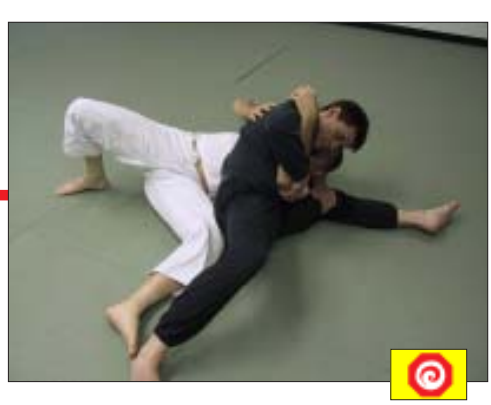
Black now slides his left knee and hips over White's left leg and moves into the scarf hold position.